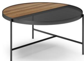
Coffee table big